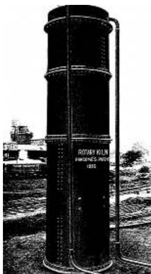
(Ransome's Rotary Kiln 1928)

Barnstone Cement Works has been standing for 157 years and is steeped in rich history and tells a story of a Works that has been a consistent and contributory part of the local community, positively impacting the local economy with many local people finding employment here. In some cases with several generations from the same family following suit. One family saw the grandfather working here, followed by the father and finally followed by the daughter. There are still father/daughter and father/son duos working here, along with many friends of friends, retaining the unique family feel of the site.