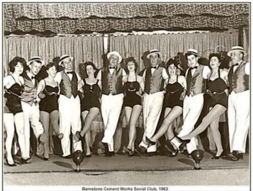
Barnstone Cement Works Social Club, 1963