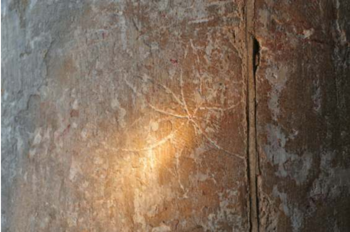
A Daisy Wheel design on a pillar in St Andrew's

For many people the word “graffiti” means buildings covered in lurid designs sprayed on by unknown vandals or, more artistically, the works of the Bristol artist, Banksy. They would be surprised to hear that almost all of our medieval churches have some form of graffiti in them dating from their building and onwards through the history of the church. Some can be found in places only the clergy would have used, others are in more public places such as the porches or around the font. Who drew the graffiti and why is not fully known but it is likely that it was seen and understood by those using the church and may even have been sanctioned by the clergy. It takes many forms such as symbols, cartoons, even text and music. Many are beautifully and skilfully drawn.