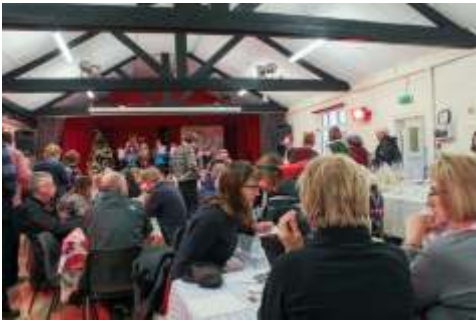
Vale Market Café Christmas 2015