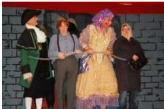
Vale Ventures 'Jack & The Beanstalk'