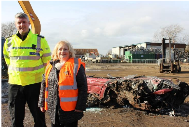
Rushcliffe Borough Council Deputy Leader and officer with the crushed van

Individuals who allegedly fly-tipped fridges on an A52 lay-by had their van crushed following enforcement by Nottinghamshire Police.